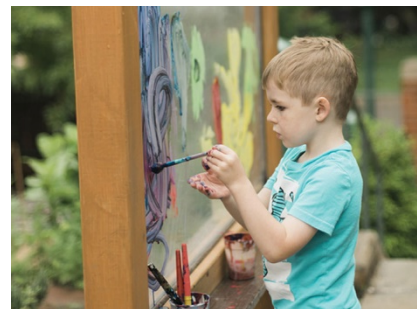
Images: The Outdoor Classroom Project, Boston Schoolyard Initiative, & Nature Explore