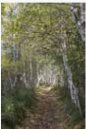
Lot# 109 Nancy Howren, "Imagine" Taken at Acadia National Park. Photograph size 20" x 13.3". Printed on archival paper with archival inks. Framed, UV glass and archival mat, 19" x 26". Donor: Artist. Estimated value: $650