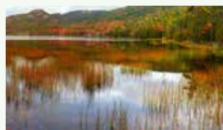
Lot# 120 Ed Monnelly, "Autumn: Upper Hadlock Pond" Landscape photographer whose work features Acadia. An archival, digital photographic print. Image, 13"x19". Framed, 24" x 30". Donor: Ed Monnelly Fine Art. Estimated value: $425