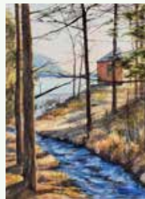
Lot# 118 Rick Osann, "Late Afternoon Eagle Lake" An original watercolor by Maine painter and scenic artist, Rick Osann, "Late Afternoon Eagle Lake" captures the view from the east end of the lake. Double matted, UV glass, and framed, 22" x 18". Donor: Artist. Estimated value: $395