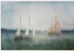
Lot# 106 Olga Merrill, "Crossing" Photograph by award-winning Maine photographer, Olga Merrill. Archival pigment print. Framed, 12" x 16". Donor: Susan Beallor-Snyder. Estimated value: $200